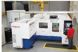
CNC Laser cutting provide precise cutting and efficient process