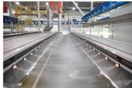
State of the art pre-treatment provide uniform coating and excellent corrosion protection