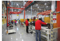
Organized, clean and systematic work environment to ensure safety and high quality control