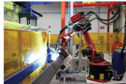
Robotic welding-High productivity, less downtime and consistent quality