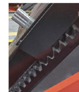
15 Level Locking Positions with Pneumatic Lock Release System