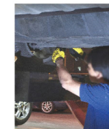
Full Height (1862 mm) for Stand-up Comfort during Alignment